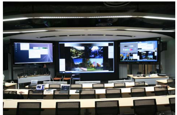
Figure 1: Concurrent design facility.

As a graphics workstation system to generate 4K stereo image, two host computers (Dell Precision T7400, 2x Quad Core Xeon 3.2GHz) and two graphics engines (NVIDIA Quadro Plex 1000 Model IV) are used.