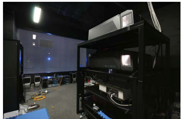
Figure 2: Stacked 4K projectors.