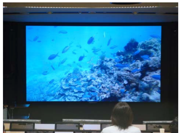
Figure 4: Scene of "Okinawa Churaumi Aquarium".